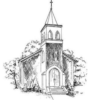
St. Stanislaus, Chatsworth Sunday 9:00 am